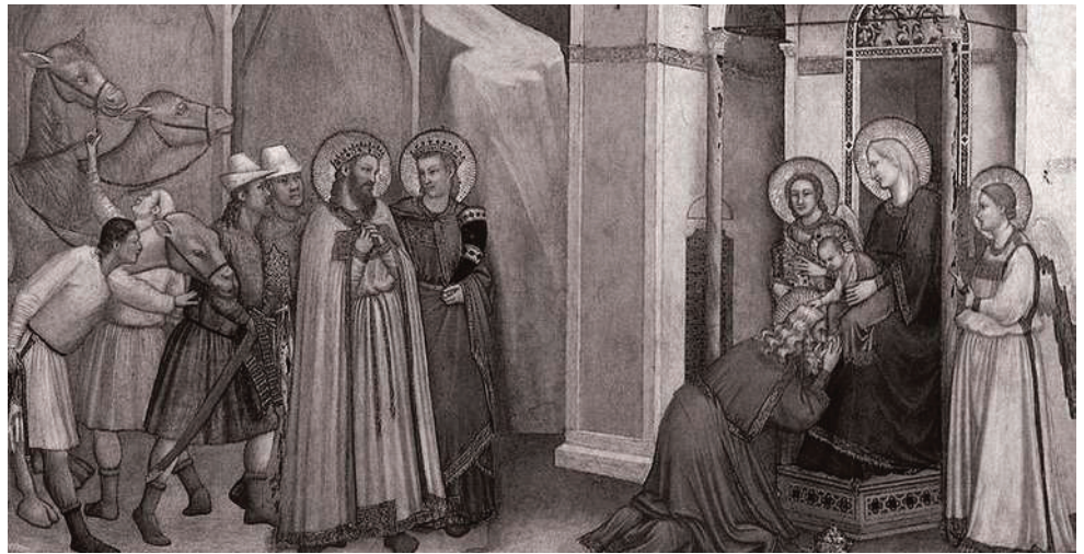
Giotto's "The Adoration of the Magi". Fresco in the Lower Church of the Basilica of San Francesco d'Assisi in Assisi, Italy

The season has been skewed by the way marketing has exploited this time; it can leave us feeling inadequate and tired. Traditionally, the Twelve Days of Christmas extended the feast from Christmas Day itself to Epiphany. In Canada, rarely do we get twelve days because Epiphany is transferred to Sunday rather than being on January 6th. School holidays often end before Epiphany. Just the same, the idea of taking time after Christmas to see each other and recharge is both relevant and beautiful. In Lent we might think about the deeper disciplines that could help us to live the Christian life more fully. But in Christmas season our appreciation and gratitude are at the forefront. And that might also lead us